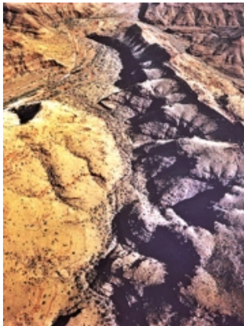
The picturesque Hamersley Ranges.

Part of the Pilbara's Hamersley Ranges has been named after the historic Hancock family, which pioneered the development of Western Australia's North West.