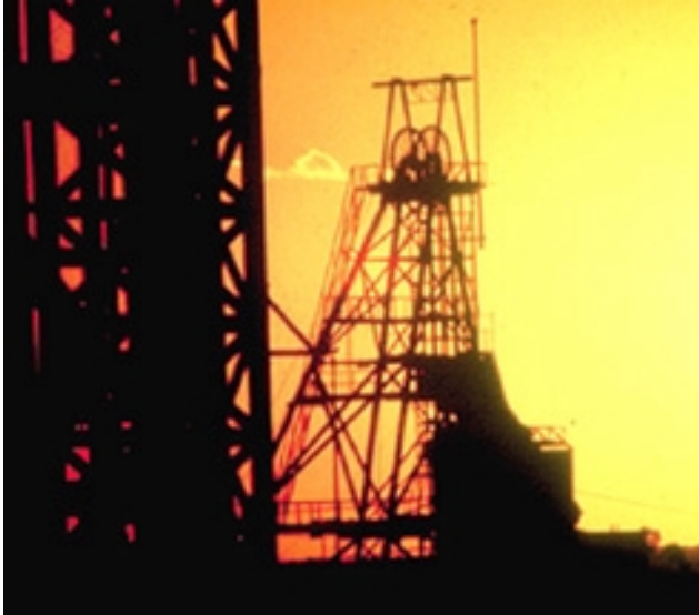
Kalgoorlie is set for residential and industrial development.

The Department of Land Administration is preparing to develop residential and light industrial land in Kalgoorlie-Boulder.