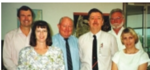
The South West Regional Team.